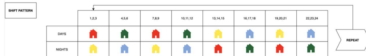
Supplementary Figure 2: shift patterns for the 'three on, three off' work schedule