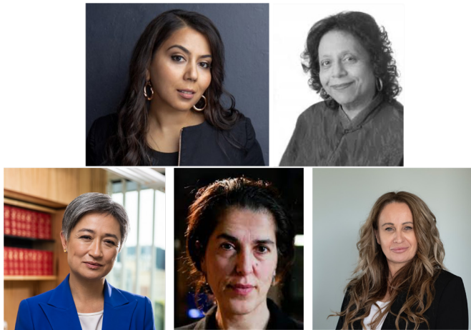
Figure 1 Five women in senior leadership positions who participated in this study.

two decades and is currently the Leader of the Opposition in the Senate and Shadow Minister for Foreign Affairs. 1