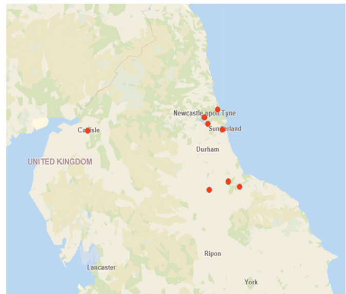
Map of NENC region showing all Acute NHS Hospital Trusts

Previous research activity indicated 1 large active site with the remaining 7 recruiting an average of 16-22 participants per study opened.